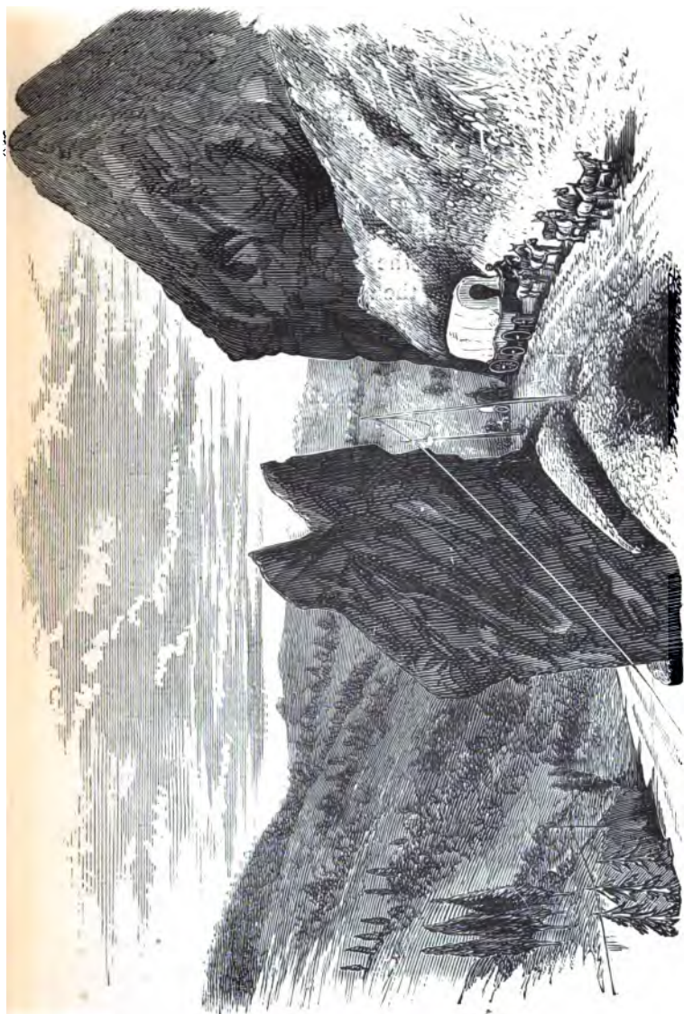
THE GREAT BLUFF ON THE T. MASON LIVER, THE ROAD FROM CARIBOO.